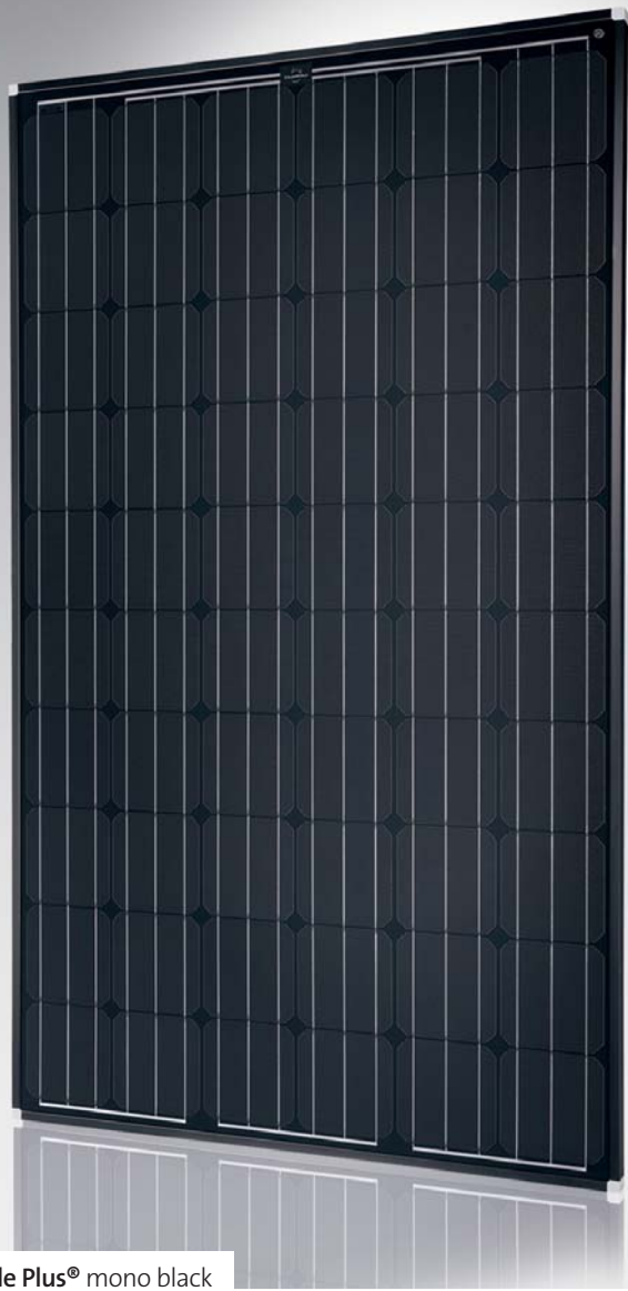
Sunmodule Plus® mono black