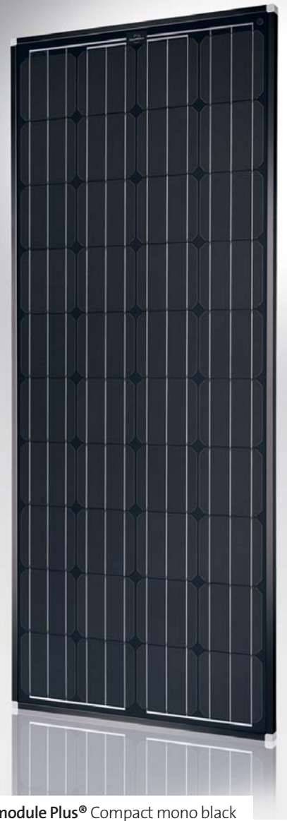
Sunmodule Plus® Compact mono black

Sunmodule Plus® outshines the competition: