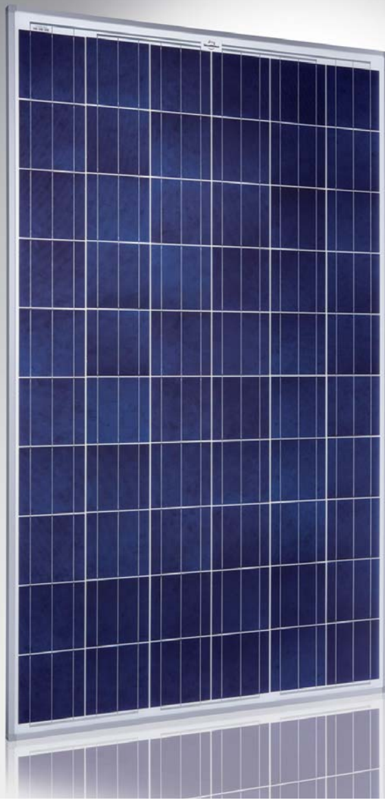
Sunmodule Plus® poly